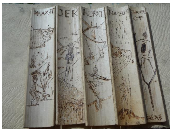
Our Oceanic languages spoken, sung, slammed, told!

This conference will also focus on the convergence of language-cultures and arts in a plurilingual and multicultural context. A special session devoted to this theme, proposes to reflect on the issues and possible explorations of a multi/interdisciplinary approach constituted by these kinds of synergies.